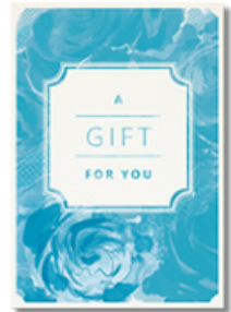
Table Hosts can thank first-time guests at the end of the event by giving them a simply wrapped A Gift for You booklet.